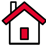
Individual properties or portfolios