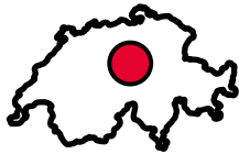
Residential properties in Switzerland